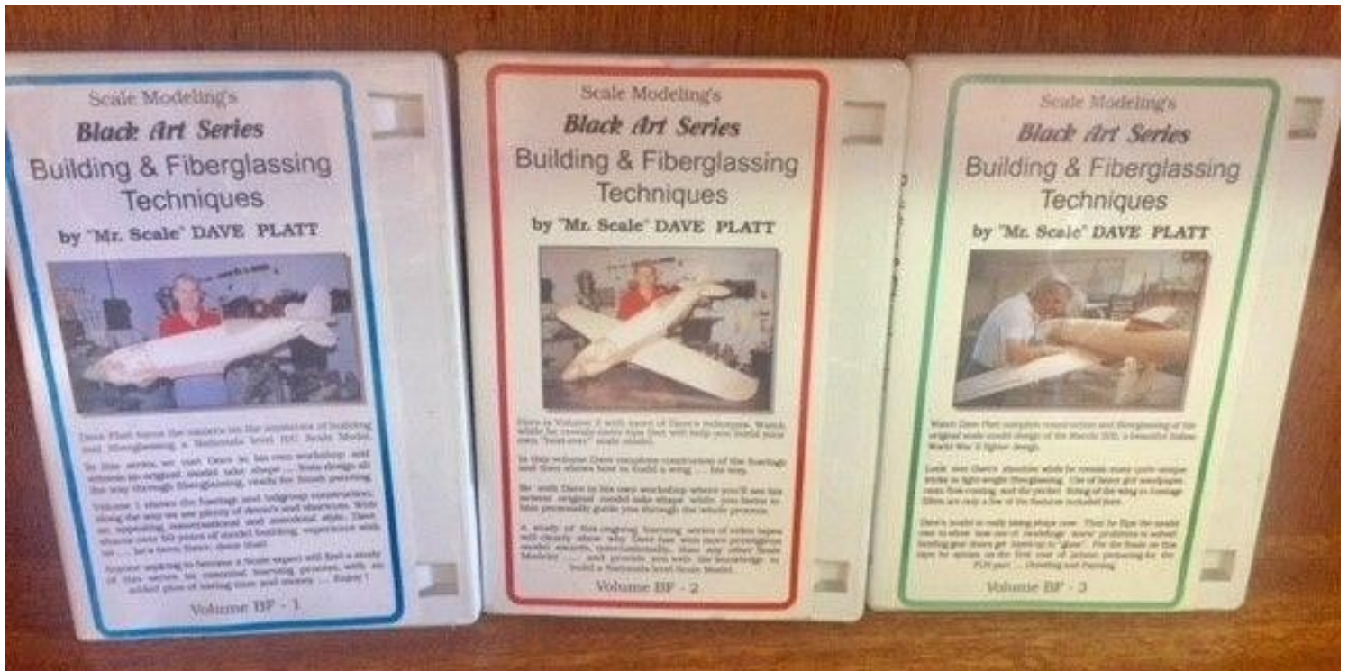
The video series by "Dave Platt" Building & Fiberglassing Techniques Volume 1 to 3 (we only saw half of Vol. 1)